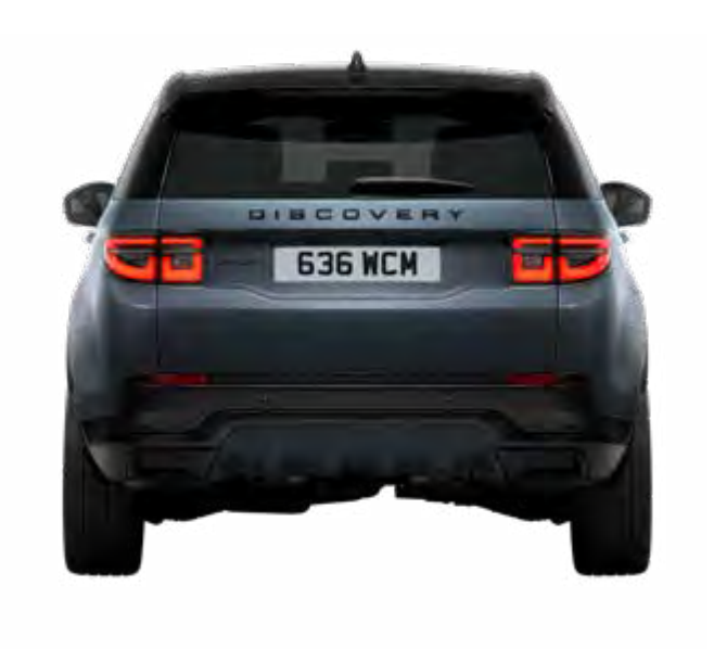
Rear wheel track 1,631.3mm

Weights and dimensions shown apply to standard-specification, unladen vehicles, which may be affected by optional features and equipment.