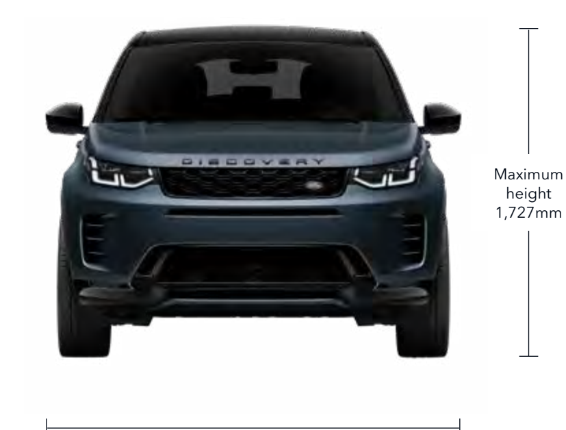
Width 2,069mm mirrors folded Width 2,173mm mirrors out

Approach Angle - 24.9°† Departure Angle - 28.3° Ramp Angle - 20.4°††