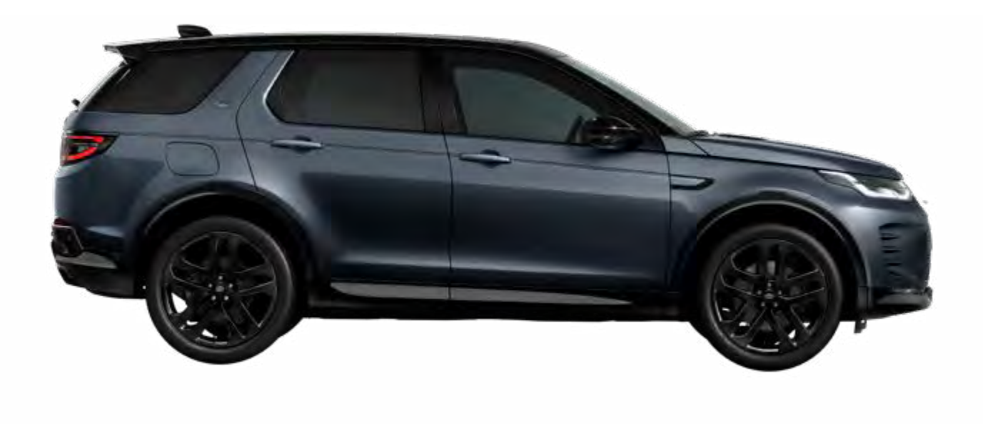
Overall length 4,597mm